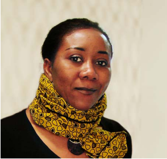
Ebele Okoye