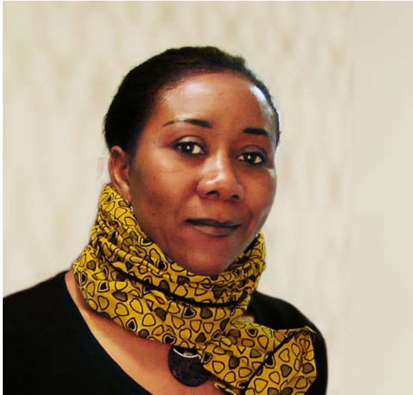
Ebele Okoye

2007: Die Verrückte 'The Lunatic' (Germany) 5 min. 2D Animation (Director/Coproducer)